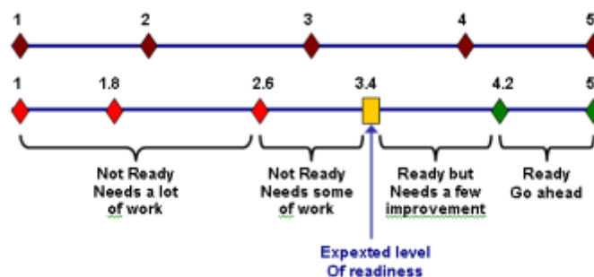
Figure 3 <Measurement Scale of Model ELR>