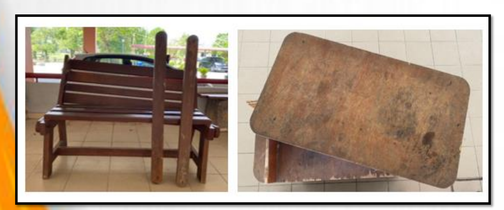
Figure 1: the condition of tables and chairs at foyer

This project is carried out based on the survey made among the students at Civil Engineering Department about the existing table at the foyer. Almost 70% of respondents, choose that the tables and chair is not in a good conditions and need to be replace. Furthermore, the number of table and chair is insufficient to accommodate the number of student. Development of Discussion Table, focus on durability, ergonomic and quantity to facilitate the students while they are doing discussion.