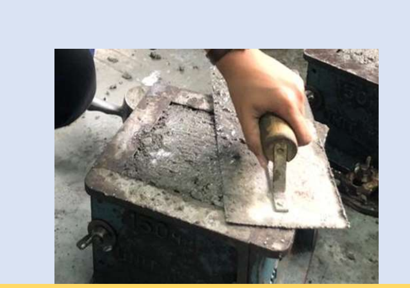
4. Level the surface of the concrete.