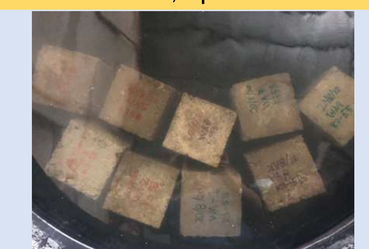
6. Curing the concrete sample in tank.