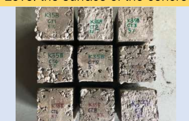
5. After 24 hours, open the mould.