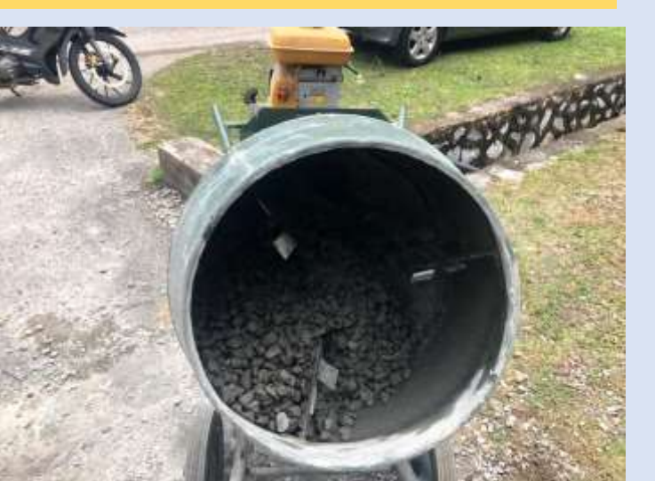
2. Put all materials in concrete mixer.