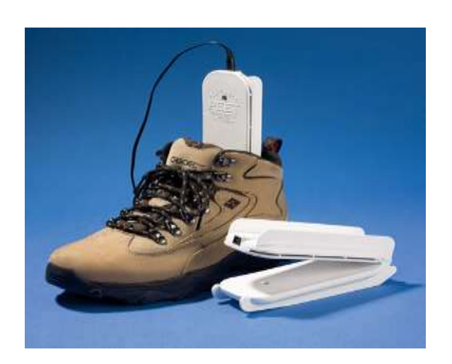
Figure 2.3.1: Portable shoe dryers at Hammacher Schlemmer

This is the portable shoe dryer preferred by our customers when they travel because they can be stored in your footwear, and when plugged into an outlet at your destination they gently, safely, silently, and thoroughly dry your footwear overnight. The dryer fits inside a shoe to gradually remove moisture, eliminating bacteria build-up without damaging the material or shape of the footwear. A 20-watt thermal convection heating process silently circulates room air into the dryer, and throughout the shoe. Easy-to-transport, the dryers are ideal for hunting trips, beach vacations, ski or hiking excursions, or out-of-town marathons. Made by PEET, inventor of the original electric shoe dryer in 1968. Can be used with Mens footwear sized 7 and up, or Women's sized 5 and up. Set of two. 2 3/4" H x 2 3/4" W x 7 3/4" L. (3 lbs.).