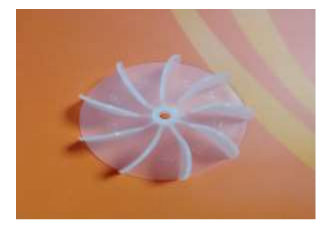
Figure 3.3.5 - FAN WITH NUT

Fan are used to sucked the room temperature air and transformed to hot air by heating coils. The fan also can be found in small size that goes along with our plan to succeed Shoe Dryer project.