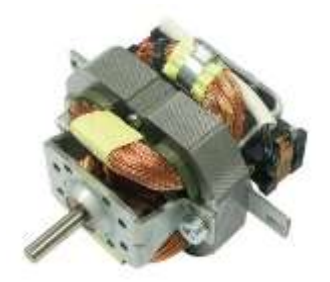
Figure 3.3.4 - MOTOR

Motor also takes big part on generating the electricity for the fan to spin. This mechanism also allows room temperature air to be sucked in through the vent of our shoe dryer and then to be blow over the heating coils.