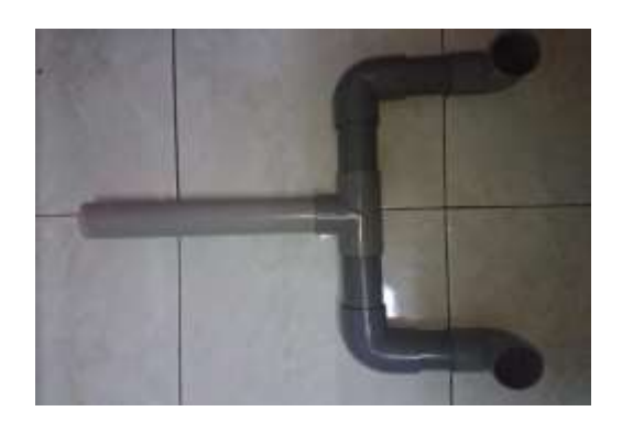
Figure 3.3.1- PVC PIPE(BODY)

PVC is used because its abrasion resistance, lightweight, good mechanical strength and toughness. PVC can be cut, shaped, welded and joined easily in a variety styles. Its light weight reduces manual handling difficulties not forget to of its low cost and easy to find hardware store.