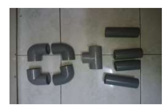
Figure 3.3.2 – PVC PIPE CONNECTOR AND COUPLING SET

PVC also came with varieties set and types of connector. They are a small part that connects or "couples" one part to another, usually permanent. They can connect pipe to pipe and pipe to fitting. Some of them even reduce so you can connect a small pipe to a large pipe or vice versa.