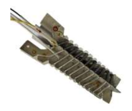
Figure 3.3.3 – HEATING ELEMENT + RESISTANCE

We intend to use a heating element from hair dryer components because its size that fit with our ideal size to create shoe dryer. On behalf its function, first and foremost the heating element itself is a bare, coiled nichrome wire that's wrapped around insulating mica boards. Its poor conductor electricity compared to something like copper wire. This gives the alloy enough resistance to get from all the current flowing into it. Also, does not oxidize when heated.