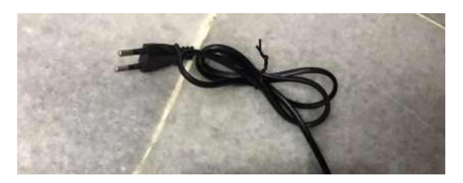
Figure 3.3.6 - CABLE 3mt + PLUG

Function to generate electricity from household power. Also we can get the cable in varieties length and easy for our shoe dryer extended their wire to make itself more convenient to use in any space.