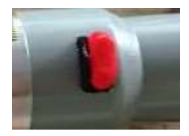
Figure 3.3.7 - ON/OFF SWITH BUTTON

Operating as to complete electric circuit when we press on it. To allows the electricity to flow and activates the shoe dryer.