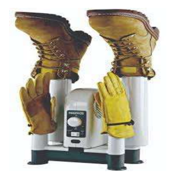
Figure 2.3.2: Shoe and glove dryer

A small fan pulls air through the shoes and gloves. In the portable unit shown here, you can turn the heat on or off. This boot dryer will also dry one pair of shoes or boots plus a pair of gloves at the same time, according to the product literature. For this particular model of shoe dryer, some thought needs to be put into supporting the unit. Other, more expensive models have their own stands.