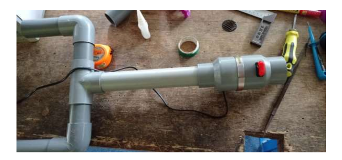
Figure 3.5: An Overview of Portable Shoe Dryer

The sketch of portable shoe dryer is a compact, lightweight portable footwear and garment dryer that operates on three power sources drying footwear and garments anywhere. Legs extend to fit and retract for easy storage. Also, the user can carry the tool to anywhere without having a storage problem. The Shoe Dryer 2.0 utilizes forced ambient (room temperature) air powered by the rotation of the fan driven by an electric source and heats the air heater at a low level of this design is to make it easy for people to dry their shoes in hours. The material of the tool are made from PVC pipes as a body / air duct that will be channeled into the shoes. The shoe dry time are approximated about 60{\sim}80 Minutes.