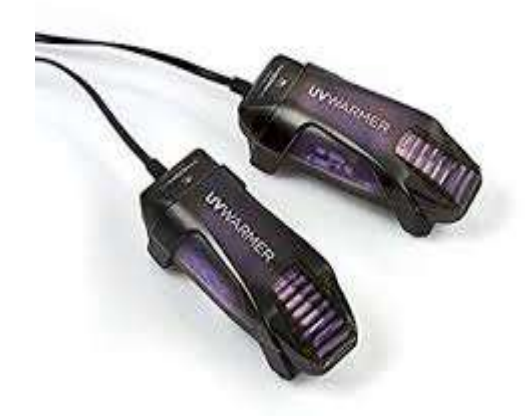
Figure 2.3.3: Pro-Jdée United Kingdom - UV Shoe Dryer

A thermo switch and a thermal safety fuse prevent the ventilator from overheating and ensure gentle drying. Ideal for preformed shoe liners and insoles.