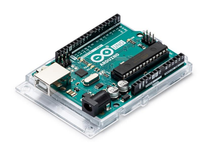
Figure 2.4.2: Arduino

I will be using an Arduino to make this jig. Arduinos are very standard, easy to power and are a breeze for short projects like this. The Arduino also have a proto shield PCB