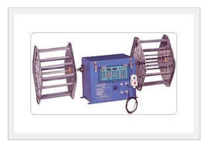
Figure 2.4.1: Motor

This is the progressed high performance "squid jigging machine" which inherited the traditional great features such as "AC servo motor is loaded," and "high-speed cycle time is realized by a round drum". In particular, the "sharp stick slide" by a round drum not only has a good articulation but also realizes the nylon string trouble reduction and the improvement of the operation efficiency, it has been pleasing the customers.