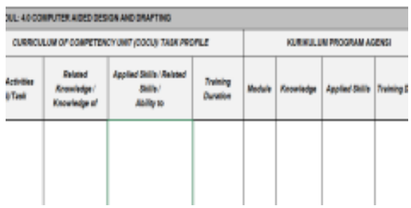
Fig 3. COCU Vs Syllabus.

This detailed section involves knowledge, skills, and training period. However, it is recommended that ONE (1) additional line cell section be added for the purpose of recording knowledge or skills that are not on the syllabus. This post (only polytechnic reference, the original format is used for JPK level) will be used to make additional training/ finishing school for the purpose of meeting the knowledge, skills and training hours set by each WA Core Abilities has FOUR (4) different levels and each level has its own module. For the implementation of the modular programme, the Core Abilities module is not mandatory.