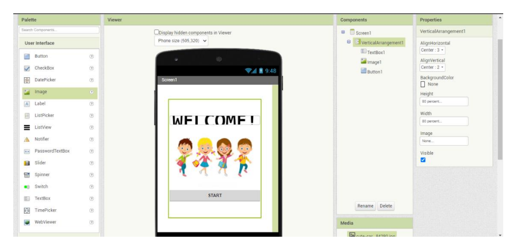
Figure 3: Testing the visual of the game

This section of the experiment shows how to create software or a game using the MIT App Inventor and how it will communicate with the Arduino via a Bluetooth module. MIT App Inventor is an open-source tool for people who want to create simple software or games using blocks as programming. The goal of this experiment is to ensure that the game visual is in the right location on the graphic smartphone and is linked to the programming and hardware and to make sure that the Bluetooth was connected successfully and the motor can be controlled.