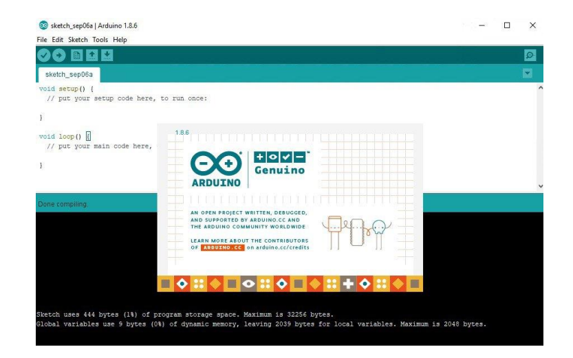
Figure 2: Arduino Software IDE

The Arduino Software (IDE) was used to make this project, which is open-source software that allows users to simply write code and upload it to the board. This software works with any Arduino board. There are two kinds of programming systems: Arduino programming language (based on Wiring) and Arduino Software (IDE) (based on Processing).