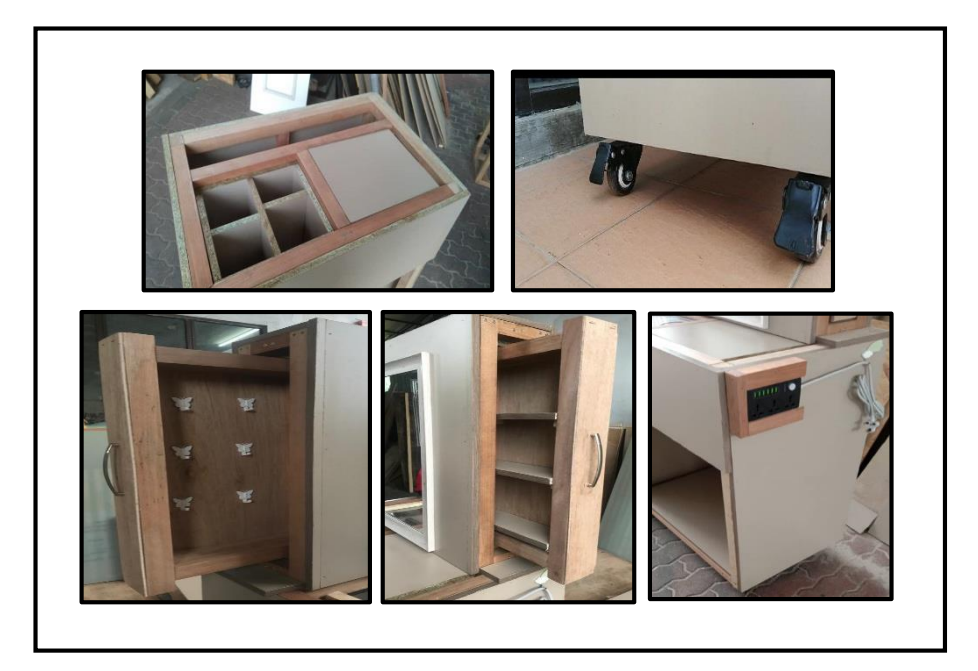
Figure 5: Proposed solution in SDT

Then this dressing table has two wheels that can rotate up to 360 degrees and the other two wheels move in parallel. In addition, the USB socket holder is also added to facilitate the use of electrical items related like hair dryers, shavers and at the same time for charging mobile phones and so on. Finally, SDT comes with a chair and if not in use can be stored in the space provided.