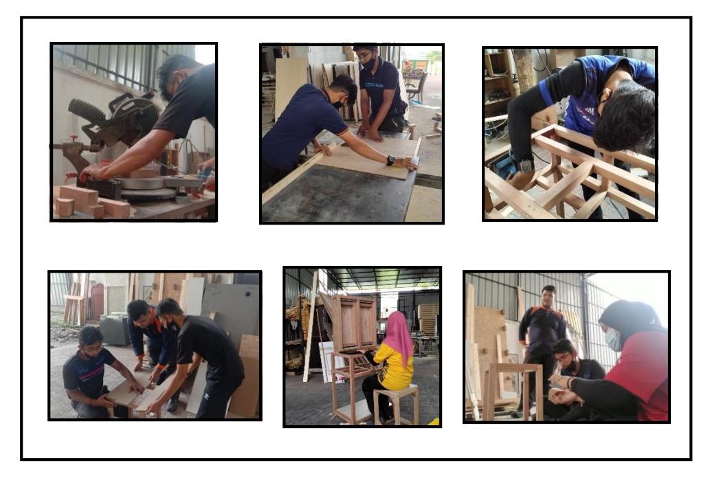
Figure 4: Smart Dressing Table (SDT) Making Process