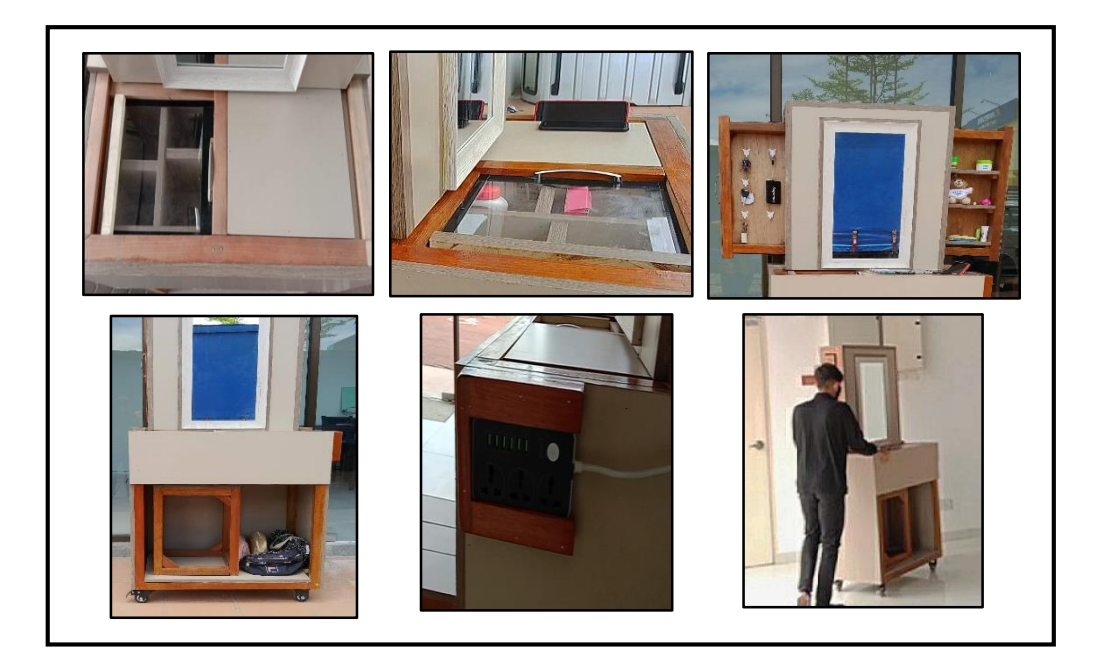
Figure 6: Benefit of SDT

Meanwhile, the addition of this USB socket helps the user to use electrical or electronic hardware at the same time such as the use of a hairdryer, shaver and in addition to charging the phone. SDT also, comes with a chair and if not in use it can be stored in the space provided. Finally, the specialty of SDT are, it designed with wheels, which definitely makes it easy for users to arrange the position of SDT in any desired space. Only one person is needed to do this job compared to the existing dressing table.