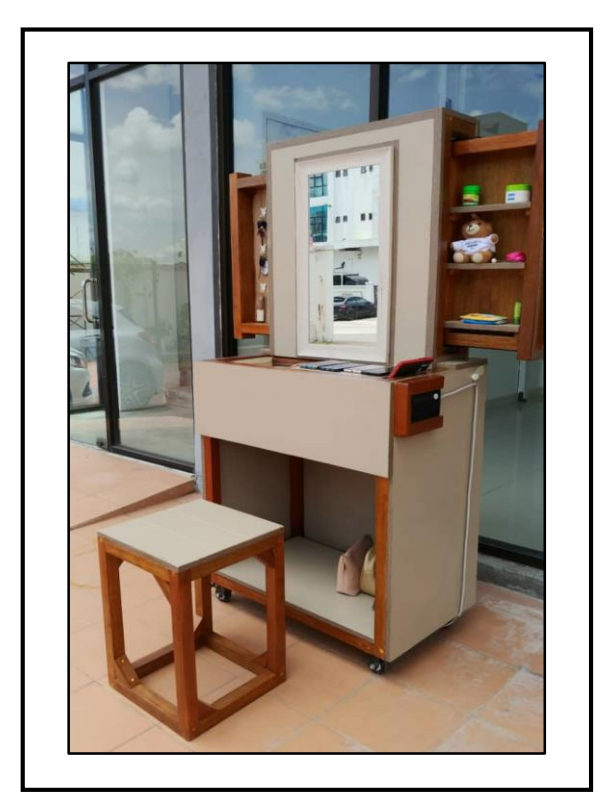
Figure 8: Smart Dressing Table

The idea of SDT started with exploring small living spaces towards how one deals with storage for those who are living in city and town apartments. With some innovative ideas that been added, born our Smart Dressing Table. The aim for this project is to be a solution to for the problems that common dressing table in market.