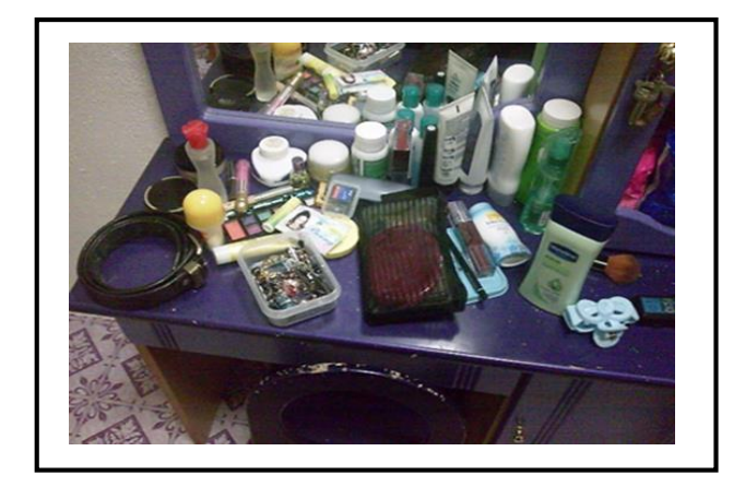
Figure 1: Makeup equipment that not well organize

In market today, most dressing table design comes with a mirror and one drawer only. Unfortunately, drawers are often not as large as one would want them to be. The absence of proper storage could cause all the items scattered on the table, spilled or fell to floor by accidental. Furthermore, the design of mirror's positioning now has caused users to move closer to the mirror when to do their makeup. As shown in Figure 1.