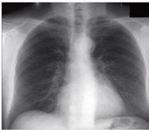
Image obtained from conventional x-ray machine

Merujuk kepada Rajah B1, tulis satu esei yang membincangkan dengan jelas keperluan imej keratan rentas dalam diagnosis perubatan.